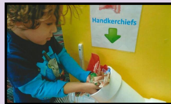
The "handkerchief chute" is also a big favorite!