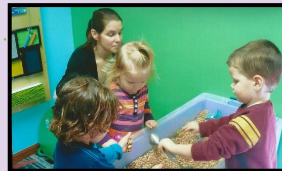
The "bean box" seems to attract most children!

Thanks to a grant from the Blue River Community Foundation, The Arc of Shelby County and the City of Shelbyville Racino funds, we are able to offer sessions in the gym at only a modest per-session fee. The small charge will help pay for the replacement of current equipment and help us keep the gym operating with current and new items well into the future. If a family is unable to pay a partial or full fee, we will work to find a way to help. The gym will sometimes offer "open gym" at times that do not require advanced reservations.