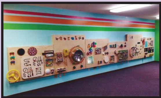
The Unique 24-foot, 6-panel Tactile Wall, Featuring Almost 100 Sensory Items of all Kinds

The SENSES Indoor Playroom Gym is now proud to be a part of the SCUFFY family of services provided to the young children of Shelby County.