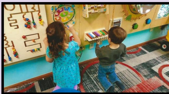
The 24-foot tactile wall is a major feature of the gym.

Parents and guardians are expected to work with and guide their children in learning how to safely use the equipment, toys and gadgets. Parents will also help their child engage socially with other children while they experience the various sensory equipment. The Arc volunteers will make every effort to seek input and guidance from professionals in the field and the special education professionals in the local public school system, but parents must play the lead role in working with their children.