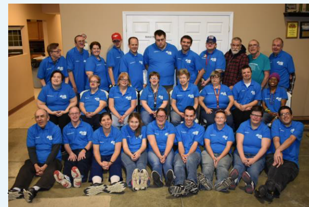
Group photo at an Aktion Club Meeting

PH: 317-398-6708 or 317-370-8238 www.facebook.com/shelbyvillevcaktionclub